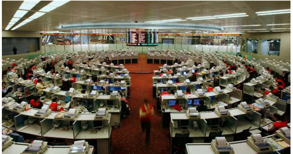
A floor trader walks out of the trading hall during morning trading at the Hong Kong Stock Exchange.

Wang says that clients last year showed increasing interest in cross-border business opportunities including M&A, with investment flowing into a very wide range of countries and regions. “Equally, Chinese investors are focusing on an ever-widening range of industries for investment, including new energy, TMT, entertainment, agribusiness, real estate, infrastructure and healthcare,” she adds. “We expect these trends to continue and intensify in 2015.” Additionally, she notes that there has been an increased tendency in China to litigate to resolve disputes. Finally, the IPO market in Greater China was strong last year, with 252 IPOs raising a combined $42.2 billion, up 95 percent by deal number and 89 percent by proceeds from 2013, with industrials and TMT being two of the key sectors for IPOs, and Wang expects to continue to see strong performances in these sectors and