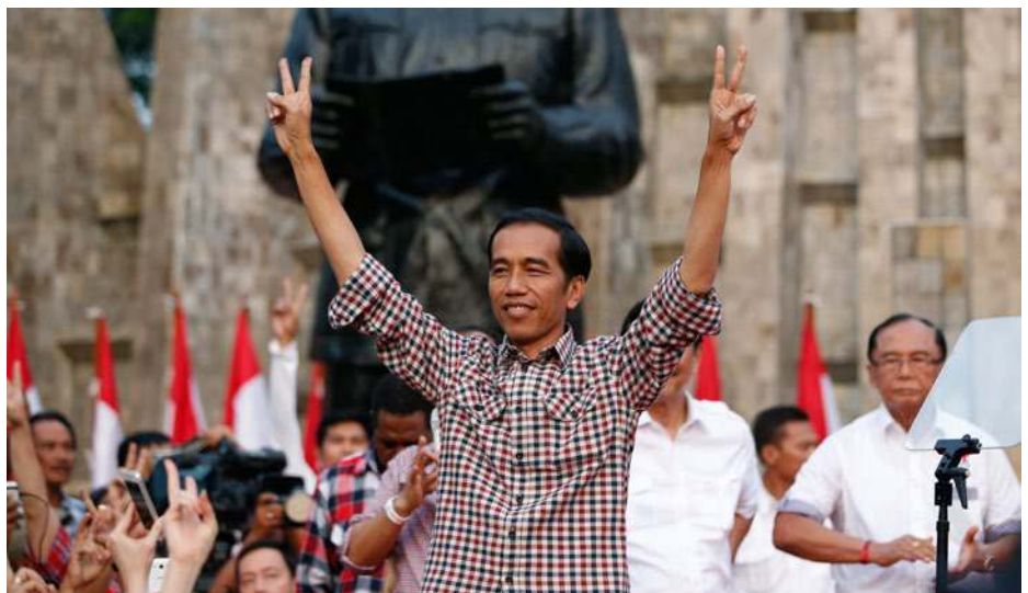
Indonesian presidential candidate Joko "Jokowi" Widodo gestures at a rally in Proklamasi Monument Park in Jakarta.

In addition, he says the the Indonesian Financial Services Authority (OJK), the institution overseeing banks, finance companies and public companies, has been actively issuing