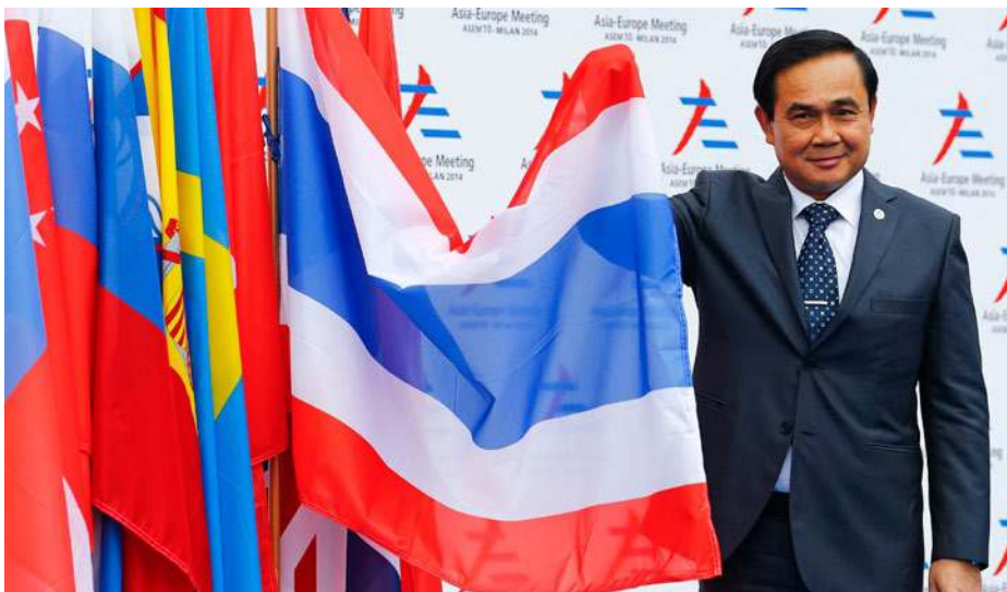
Thailand's Prime Minister Prayut Chan-o-cha poses as he arrives for the Asia-Europe Meeting (ASEM) in Milan.

joint venture firms that are majority owned by Thai shareholders, stirring much consternation among foreign investors," she notes. "The proposed changes to restrict foreign ownership in joint ventures have, however, been rebuffed through the joint efforts of the foreign investment community, and for now, the status quo is being maintained. Thailand's military leaders are apparently inclined to foster a friendly, stable investment climate that is in line with ASEAN Economic Community integration."